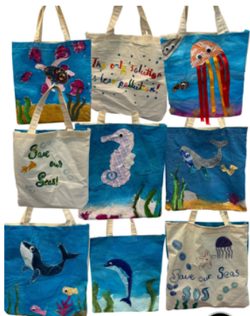
Year 5 textiles at AMS

Textiles at AMS - We are proud to celebrate the outstanding creativity, technical skill, and imagination shown by pupils across all year groups in Textiles. Each year group has worked creatively and with growing confidence to design and make high-quality textile products.