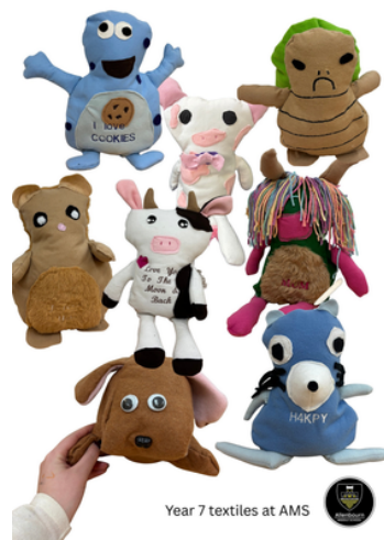
Year 7 textiles at AMS