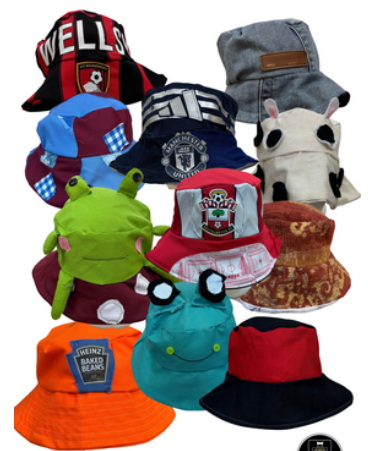
Year 8 textiles at AMS