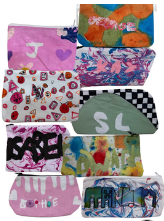
Year 6 textiles at AMS