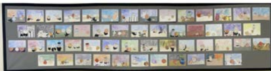
Food Collages inspired by Cezanne